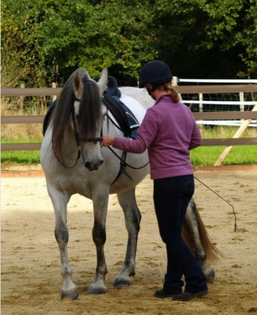
Using lateral work to supple, straighten and balance the horse

individual movements are not marked but three sections (gaits, general aspects and rider) are awarded marks much like the freestyle music tests of British Dressage. Judges are able to invest more time in watching the partnership before them as they don't have to give a mark and comment for each movement. This also allows for good training to be rewarded rather than just the horses with outstanding movement gaining high scores. It also allows judges scope to assess how the training is progressing and what areas the rider/handler needs to work on.